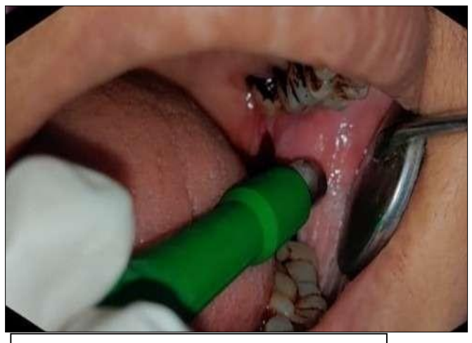
Figure 3 Showing punch biopsy

Investigations like toulidine blue staining was performed. Punch biopsy was taken from the dye uptake area. Routine hematologic tests were done which were within the normal range.