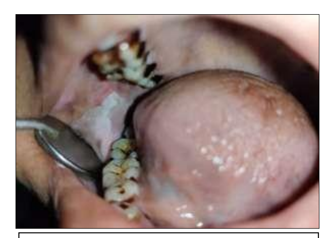
Figure 1 Showing intraoral clinical photograph on right buccal mucosa

Lesion was nonscrapable and nontender. Based on clinical findings a provisional diagnosis homogenous leukoplakia and Oral Submucous fibrosis stage I was made.