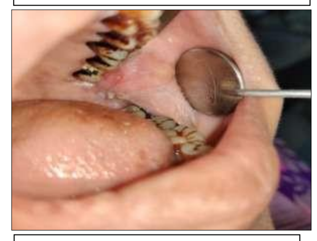
Figure 2 Lesion seen on left buccal mucosa

Journal of Interdisciplinary Dental Sciences, Vol.11, No.2 July-December 2022, 07-09