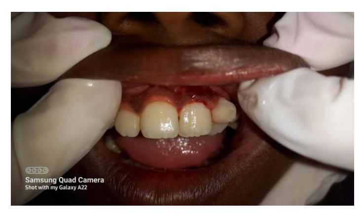
Figure no.5 post operative