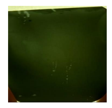
Figure no.4 foci of calcification on radiograph