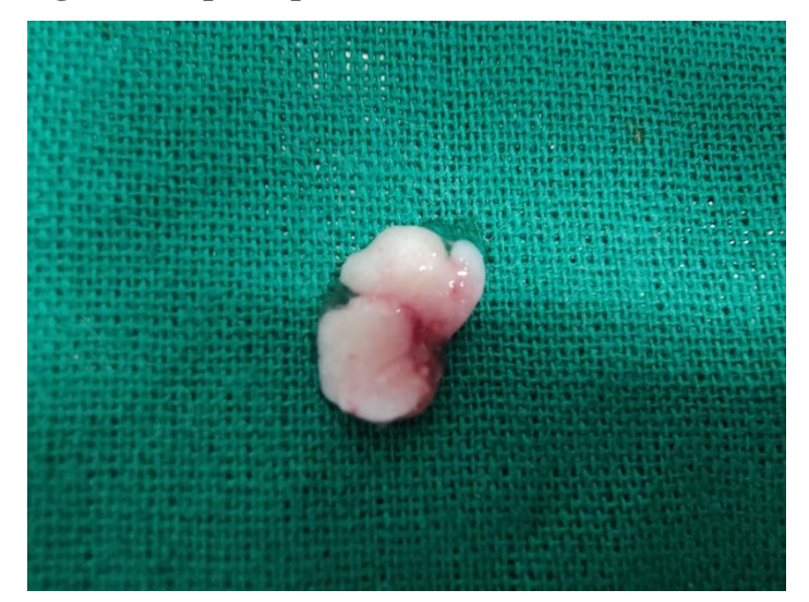
Figure no.6 excised lesion