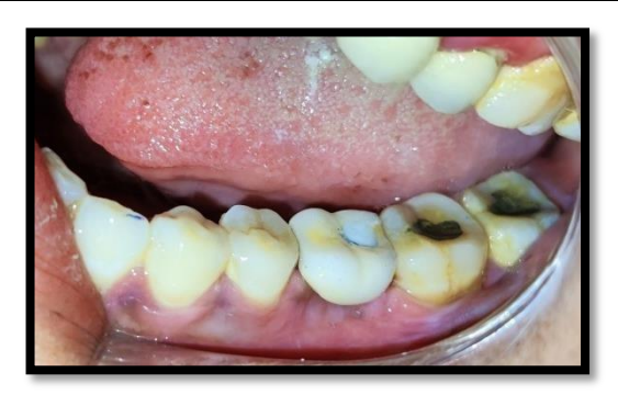
Figure 13: Screw retained porcelain fused metal crown cemented