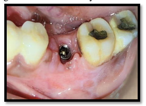
Figure 4: Placement of implant