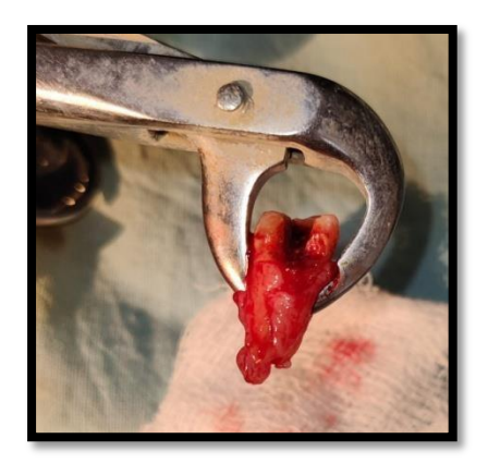
Figure 3: A traumatically extracted 36