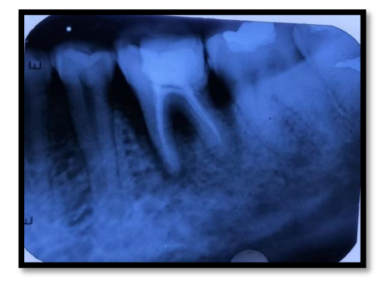
Figure 2: Pre-operative radiograph